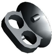
tool provided: suction cup