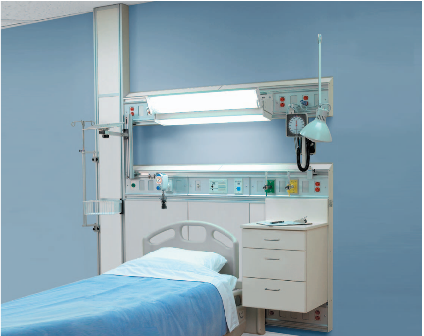
* triple tier shown with chase