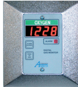
oxygen monitor with 5" x 5.5" chrome trim plate

When the repeat function is turned On or Off, the alarm set-point must be re-set.