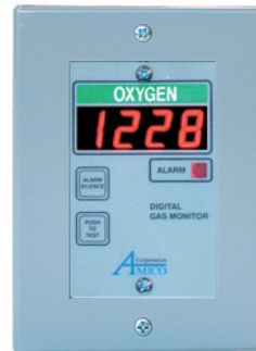
oxygen monitor with 4" x 5.25" grey aluminum trim plate